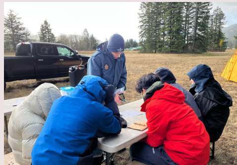
3/4 Level FTX 2023

Challenge your physical ability by pushing yourself to new limits!