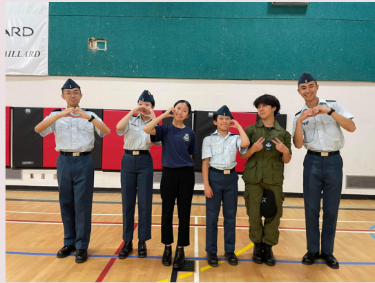
808 Drill Team 2023

The Drill Team is planning and practicing their routine for the Annual Ceremonial Review. The Drill Team is for cadets of any drill level who wish to improve their drill and participate in a team that builds confidence and leadership.