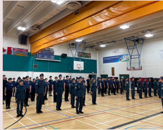
808 Coquitlam Squadron 2024

808's cadets experienced their first/ second commanding officer's parade of the year. The cadets worked tirelessly on their drill, showing great determination and tenacity. Congratulations to the level ones and accelerated cadets for completing their first march past and inspection during the parade.