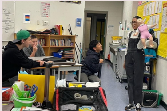
808 First Aid 2023

808 Coquitlam Cadets are planned to participate in a First Aid Certification weekend led by St. John's Ambulance.