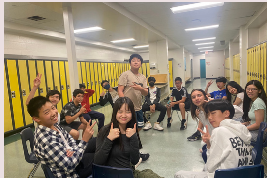
808 Speak to be Heard 2023

808's Cadet-made team STBH plans to start after the Spring Standdown. This year we will continue to learn about speeches, debates, and presentations.