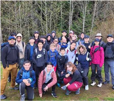
Stawamus Chief Hike, 2024

The hike has taken place at Stawamus Chief, Squamish. This activity was an excellent opportunity for cadets to challenge their physical ability, as well as meeting cadets from another squadron, 754. Embark on an exciting journey taking on a variety of fun obstacles, such as ladders and chains.