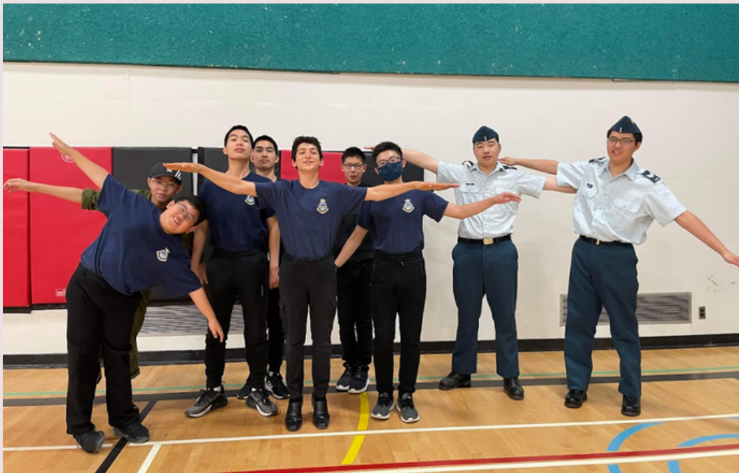
Ground School Team 2023

Learning about different weather hazards, physics of flying, parts of an engine and even the different instruments used to fly a plane, ground school gave the opportunity for cadets to dive deeper into aviation. Cadets were given a chance to build bottle rockets made out of craft supplies. Filled with interesting and exciting lessons and activities on aviation, different from regular training nights, ground school gets cadets to fall in love with aviation.